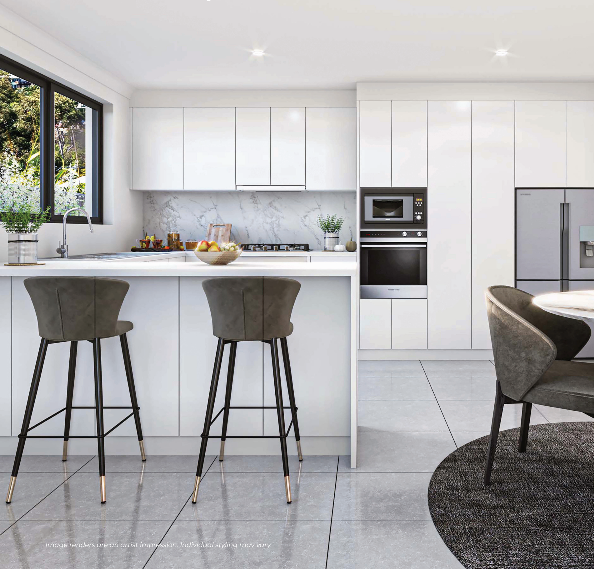
Image renders are an artist impression. Individual styling may vary.